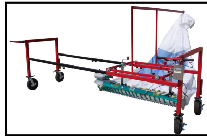
* TELESCOPING FRAME