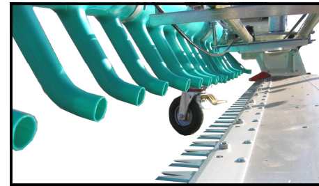
* CLIPPING BLOWER MANIFOLD