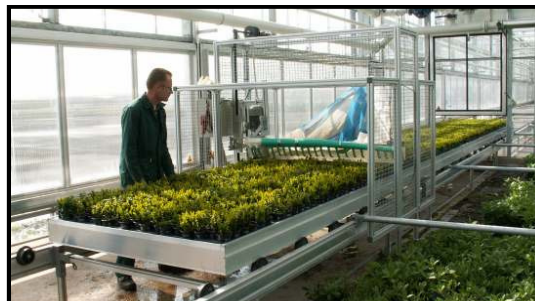
* ELECTRIC EASY CUT FOR ROLLING BENCHES