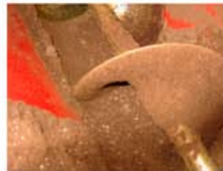
Soil Return Auger