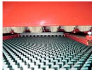
High Grip Conveyor