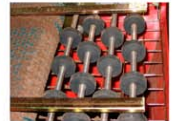
Optional Powered Transfer

Unmatched uniformity describes the results produced by this unique plug tray filler. Specially designed linear agitators work in concert with the internal vibrator ensuring consistent filling from end to end and side to side. Versatility is the added bonus. With the capabilities of filling from 800 cell plug trays and containers up to 8.5" tall, this machine is useful all season long. Standard features include built-in line integration, extra capacity soil return, variable speed soil supply and variable speed belt control.